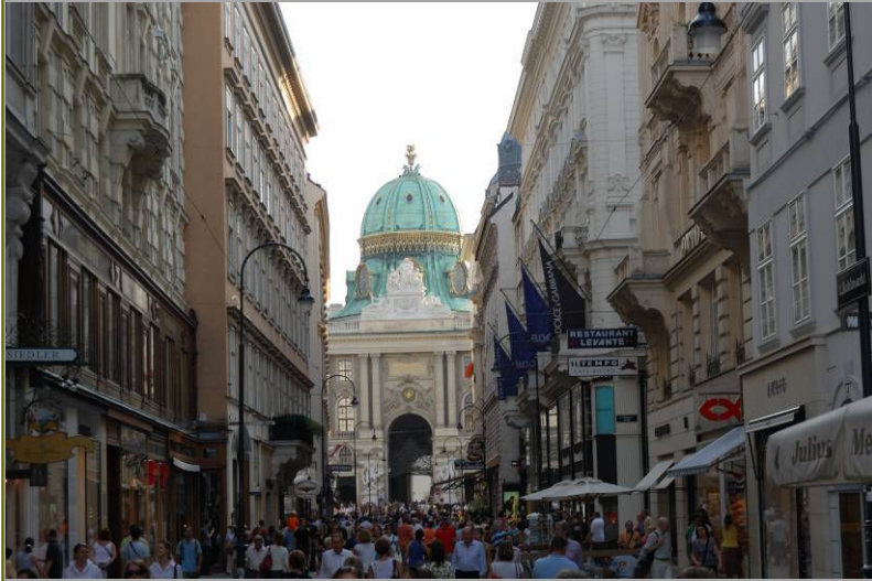
Shopping on Kohlmarkt Street looking at Michaelerplatz |

Vienna Tidbits: Have you ever watched the slow importation of a holiday? Every year we learn more about how Austrians celebrate Halloween. It seems the traditional 'All Saints Day' is becoming less important than the commercial Halloween. Rest assured, All Saints is still a day off work!