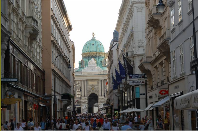
Shopping on Kohlmarkt Street looking at Michaelerplatz I