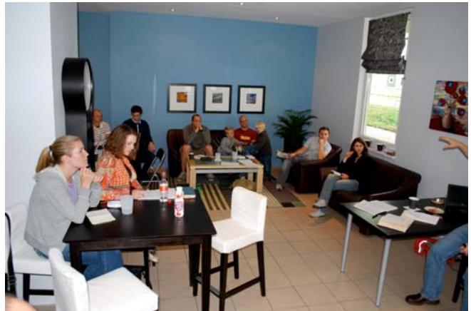
Seminar in Vienna Team office

to develop simply from the relationships God has created among individual friends here. As we participated in this conversation throughout the seminar, we discussed practical ways of being conspicuous Christians in our respective communities and also of identifying those "people of peace" that Jesus mentions in Luke 10 as he sends out the seventy-two.