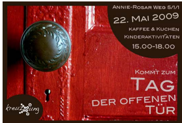
Flyer for Open House

On May 22, we hosted an open house at the office space. We prepared food, drinks, and games for kids, and we made brochures describing Kreuzung—our neighborhood organization—and some of the programs we're offering. We're currently offering a discussion group, which we've described in past newsletters, called Gesprächsrunde, as well as a weekly meeting for women with the simple goal of facilitating good conversation and friendship called