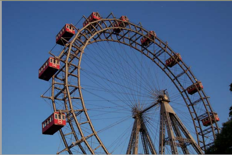
The Giant Ferris Wheel- Das Riesenrad