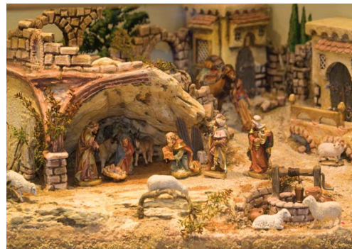
Nativity Scene on display at the Christmas Market

Please continue to pray about AND consider supporting our work. If you are interested in supporting our work you can go to our website at www.viennateam.org , click on the "Team" button at the top, then click on "Support Form" link on the left. Or you can always e-mail us at viennateam@viennateam.org .