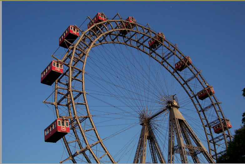
The Giant Ferris Wheel- Das Riesenrad