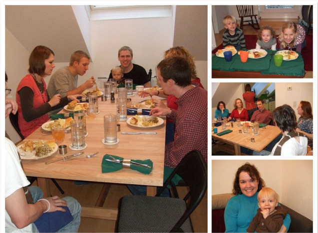
Thanksgiving at the Lockwood's

Thanksgiving always seemed liked a lazy day. I liked it that way: eating a big lunch of turkey and dressing, watching football in the afternoon, throwing around the football during halftime, going back inside to eat some pumpkin pie, watching more football! It was a slow, relaxing day